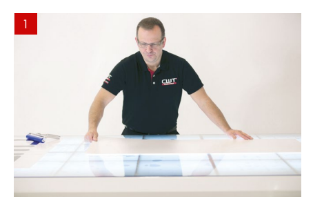
Place the substrate on the table.