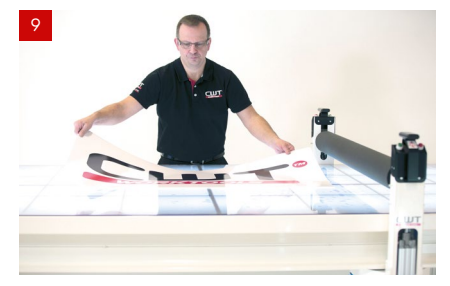
Repeat the same procedure the other way. Done!