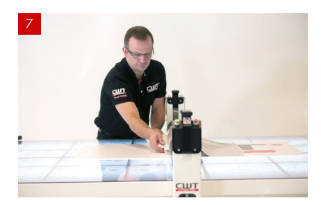
Fold the liner under the roller.