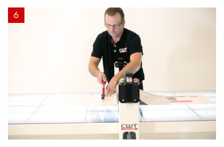
Remove any excess liner.