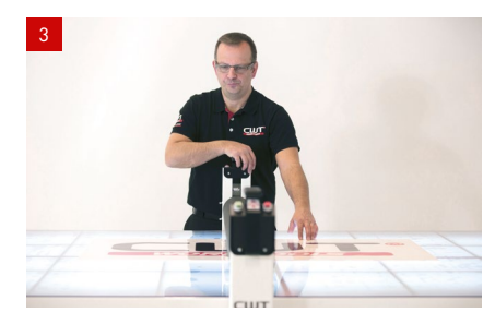
Lower the roller for fixation.