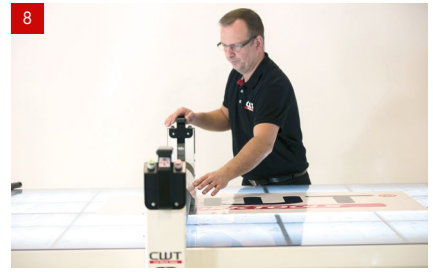
Now let the table do its job by simply pushing the roller along the table