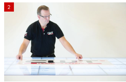
Place your adhesive material on top of the receiving material.