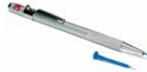
3M™ Air Release Tool 391x Punctures applied film to remove air bubbles.