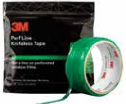
3M™ Perf Line Knifeless Tape Cuts uniform margins between window graphics and rubber moldings.