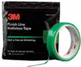
3M™ Finish Line Knifeless Tape Easily cuts most vinyl wrap films — complete installations without a blade.

Get professional results using professional installation tools.