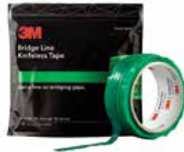
3M™ Bridge Line Knifeless Tape Evenly cuts graphics bridging from one panel to the next.