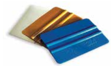
3M™ Hand Applicator PA1-Blue and PA1-Gold Reusable squeegee-type applicator for smoothing film during installs.