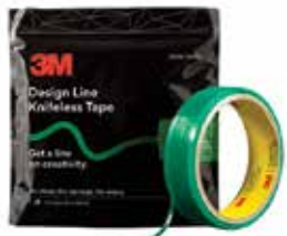
3M™ Design Line Knifeless Tape Engineered to create highly contoured designs with sharp, clean edges.