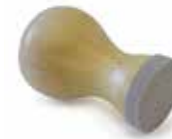
3M™ Power Grip Magic Pad Rivet Applicator CMP-1 Designed for installing 3M™ Controltac™ Graphic Films with Comply™ Adhesive over rivets.