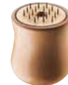
3M™ Power Grip Multi-Pin Air Release Tool MPP-1 Uniquely designed to release the air around rivets in one single motion.