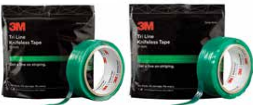
3M™ Tri Line Knifeless Tape (6mm and 9mm) Ensures accurate, consistent stripe width from one end of the vehicle to the other.