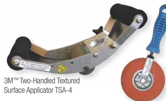
3M™ Two-Handled Textured Surface Applicator TSA-4