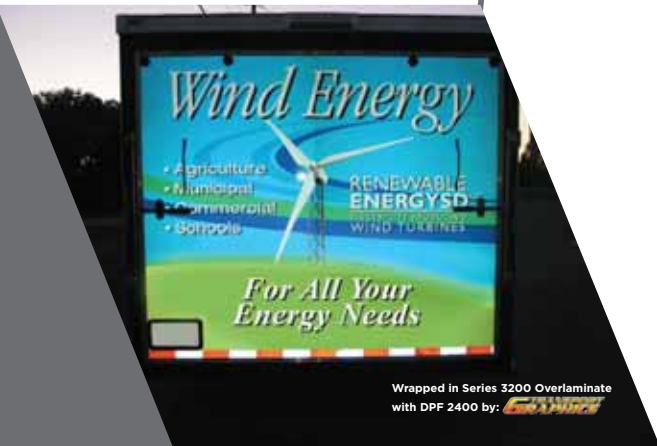
Wrapped in Series 3200 Overlaminate with DPF 2400 by: 3M