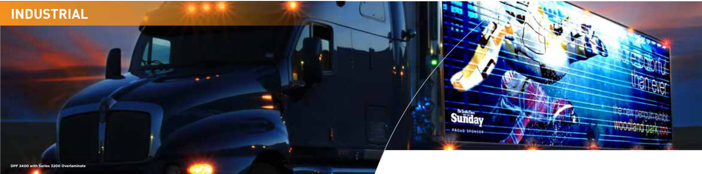
DPF 2400 with Series 3200 Overlaminate

DPF 2400 is a premium digitally printable reflective film, with a clear permanent adhesive. A conformable formulation designed for decoration of decals on fleet and vehicles. Combine with Series 3200, optically clear overlaminate to add a high gloss finish and protect graphics for long lasting results. Brighten up your vehicle graphics at night with DPF 2400.