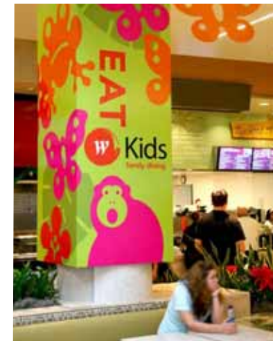
Series 3420 Overlaminate with DPF 4500G White