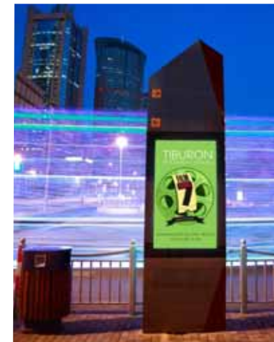
DPF 6000RP CLEAR