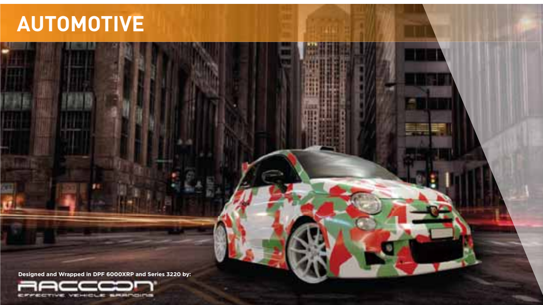
Designed and Wrapped in DPF 6000XRP and Series 3220 by: