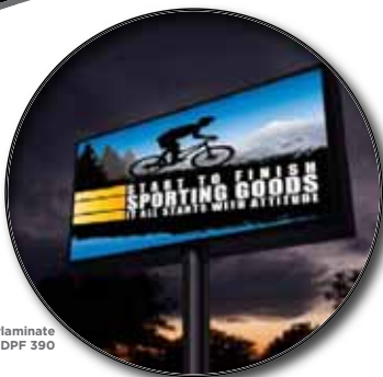
Series 3350 Overlaminate with DPF 390

Series 3590 is a heavy duty overlaminate perfect for protecting graphics where extra abrasion resistance is required. The added thickness of the laminate makes application of decals easy. Series 3590 is the ultimate protection option to extend the life of decals while providing a high gloss finish. Combine with our DPF 8000 for a vibrant, long lasting graphic to decorate your motocross bikes.