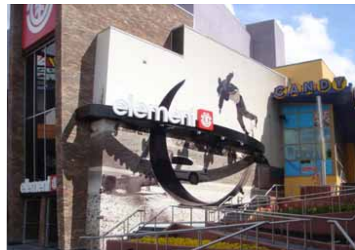
Series 3210 Overlaminate with DPF 8000 White