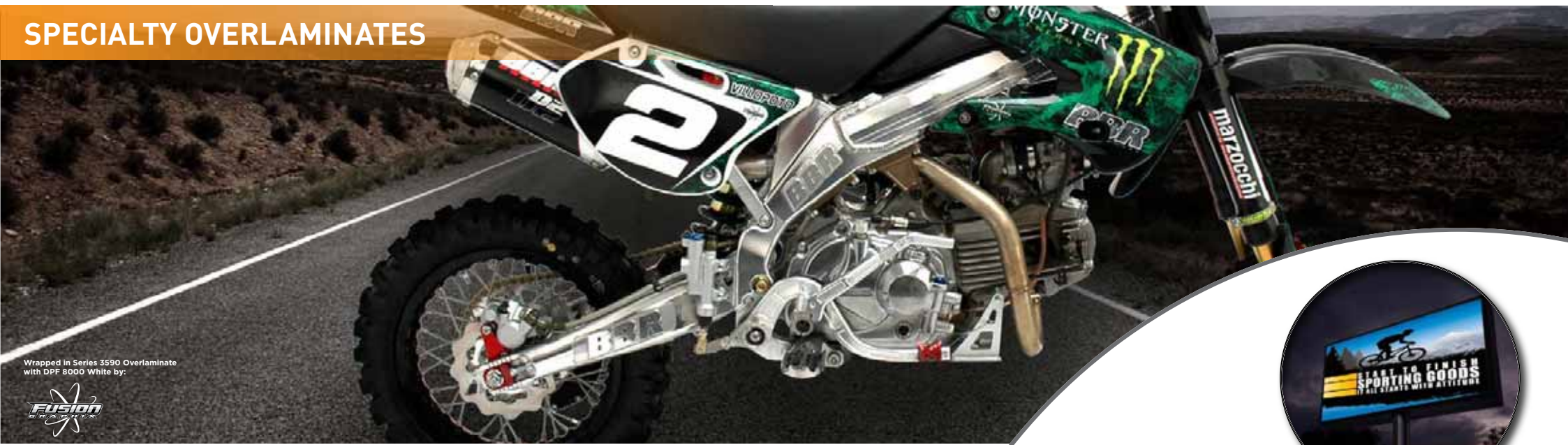
Wrapped in Series 3590 Overlaminate with DPF 8000 White by: